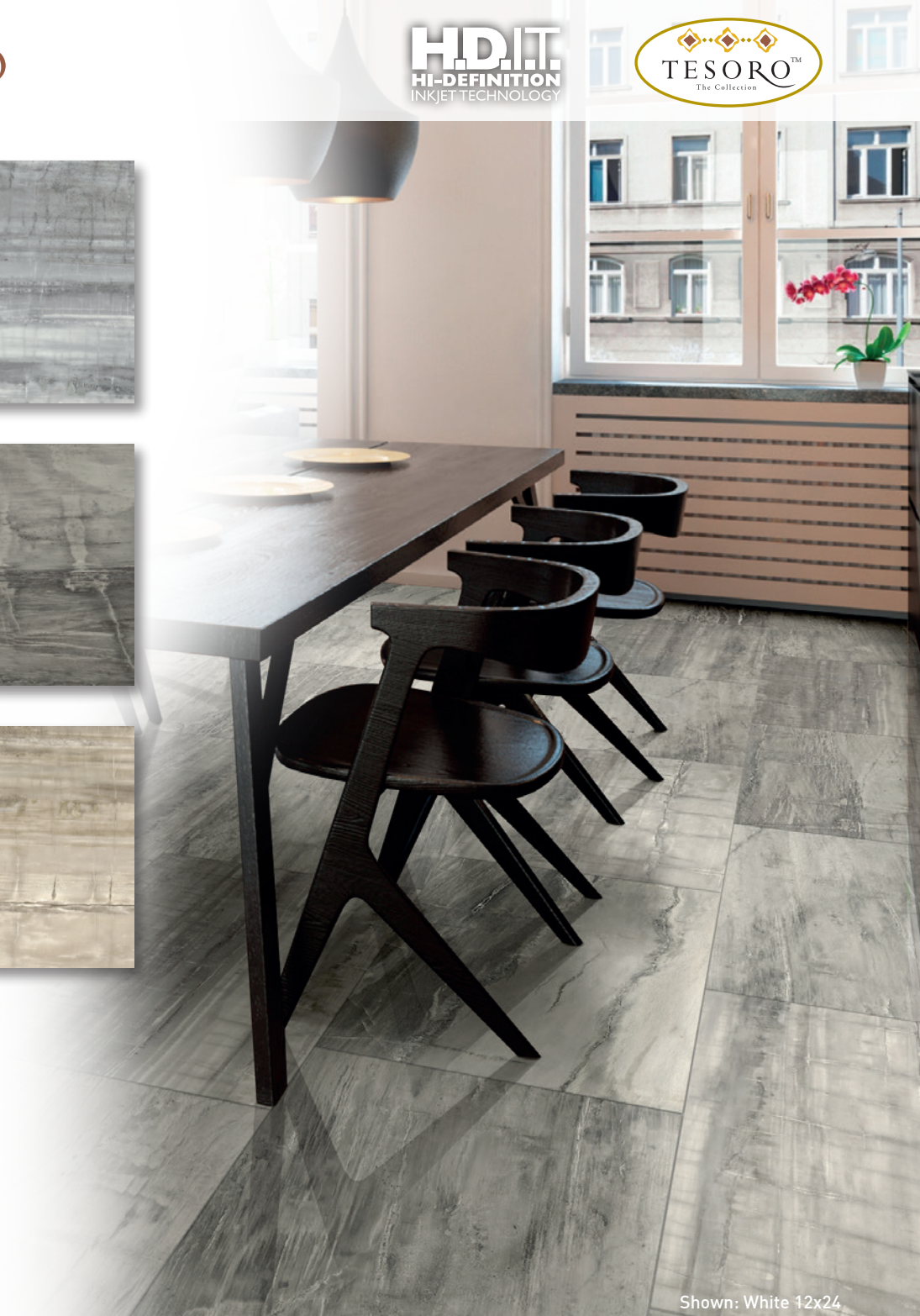
Shown: White 12x24