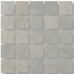
Mosaic (Silver shown)