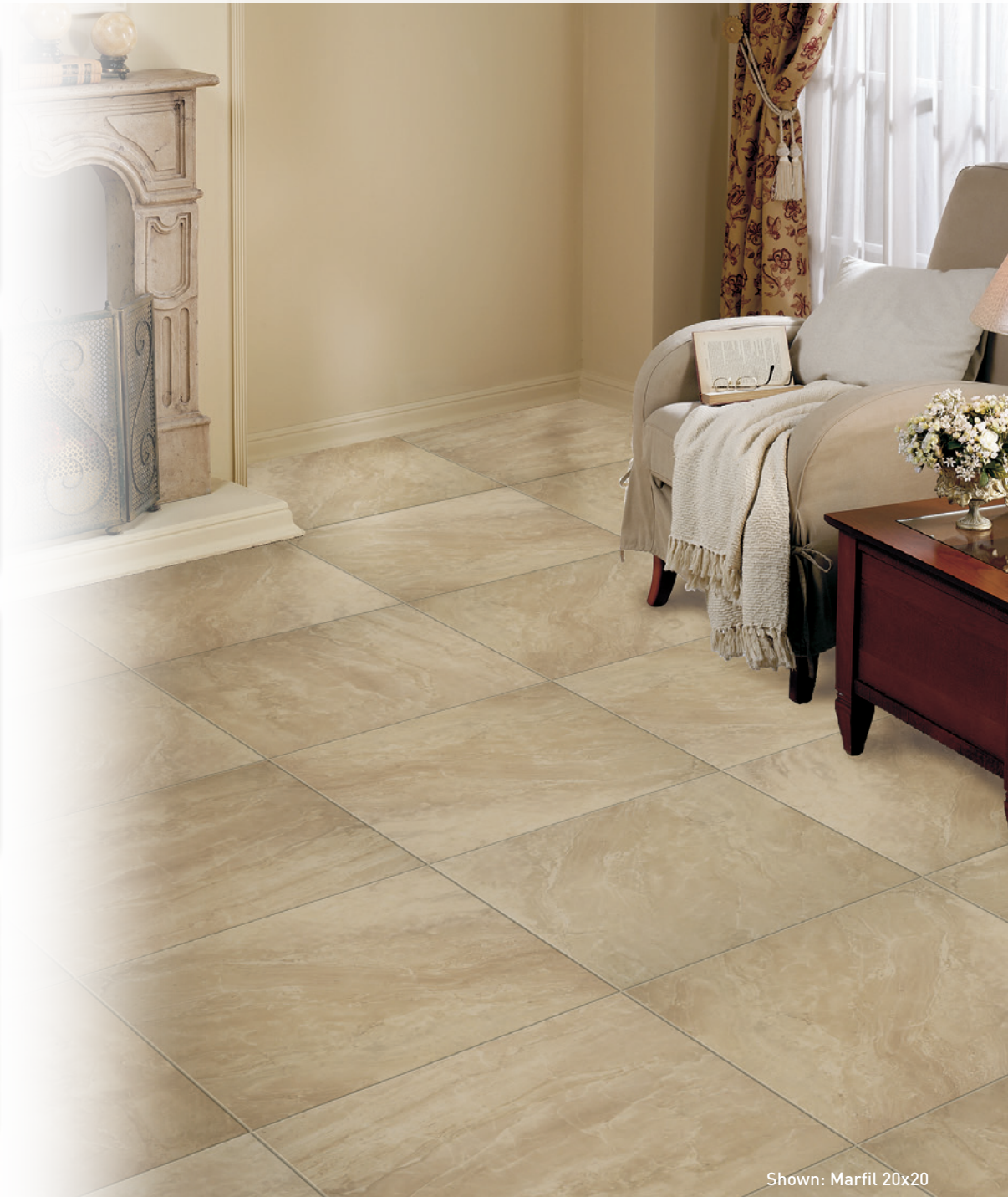
Shown: Marfil 20x20