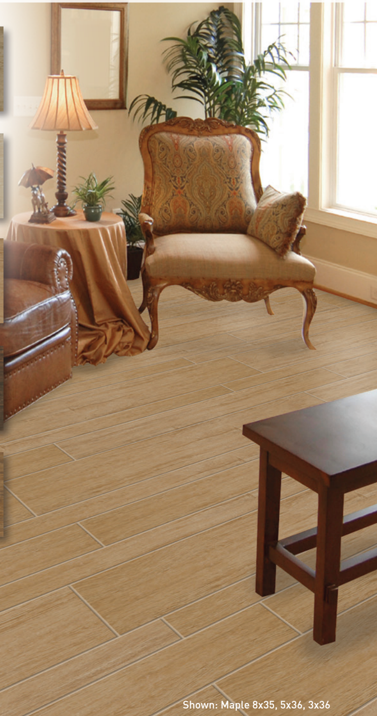
Shown: Maple 8x35, 5x36, 3x36