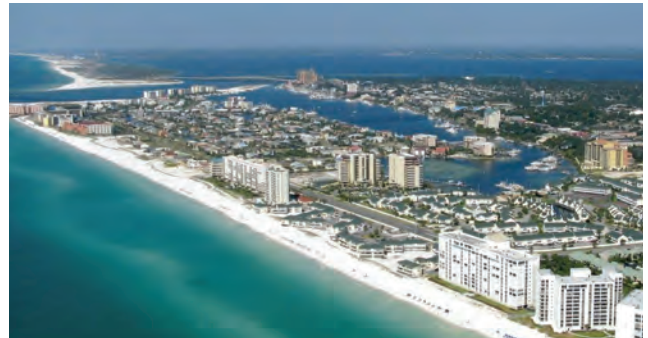
Residents and business owners from coastal cities turn to OceanGuard™ Aluminum Roofing from GulfCoast Supply to stand up against the unforgiving elements that come with coastline living.

The core of common metal roofing is Steel, with a Zinc-Aluminum coating. This composition is perfect for inland solutions but has not been engineered to withstand the unforgiving elements that come with coastline living. Harsh saltwater environments, including brackish and briny water zones, leave common metal roofs susceptible to rust and corrosion.